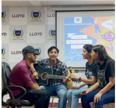
Management Sqad Committee Skill Squad Committee Melange (Cultural Club) TechGenius (IT Club) The Champion (Sports Club) Synergy (Management Club)